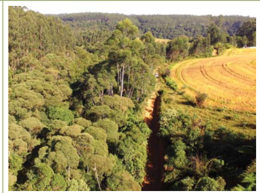
Valmor Catafesta's property, 2019.