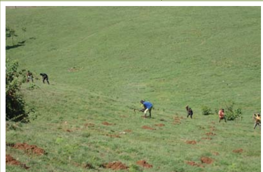
Site preparation and pitting for the next tree-planting activity carried out by a group of farmers in a formerly degraded enclosure.