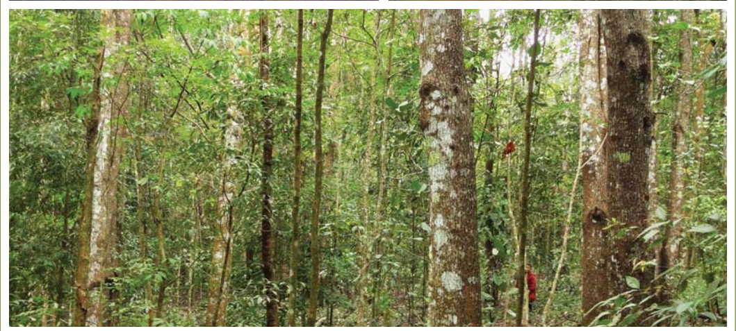
Forest restoration using the framework-species method has transformed the landscape of the upper Mae Sa Valley. (A) May 1998 before restoration. (B) Same site, left of the track, restored forest, 15 years old, planted 2001. (C) Inside nearby restored forest, 18½ years old, where a dense understorey comprising seedlings and saplings of more than 70 recruit tree species has developed.