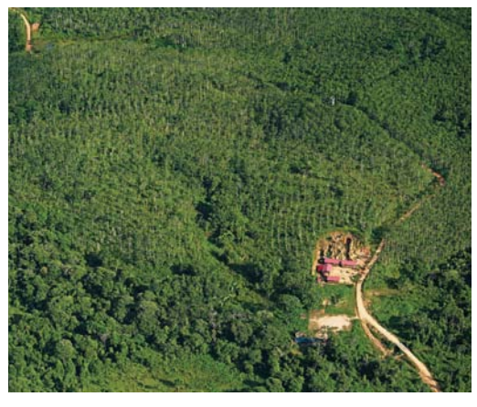
Aerial view of Bosques Amazónicos SAC's forest plantation.