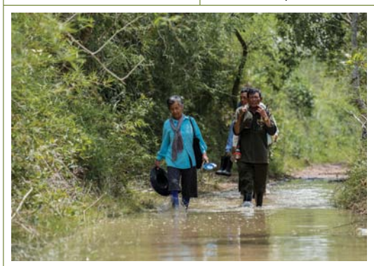
Community members of Thbong Domrey patrol their community forest.