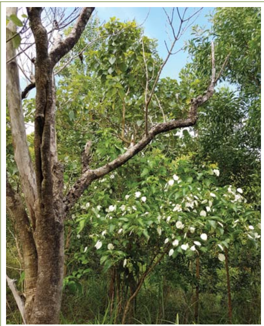
Forest restored through ANR.