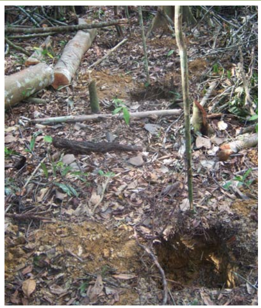
Site preparation for strip-planting at the Sari Bumi Kusuma concession with annual targets of 3000–4000 ha.