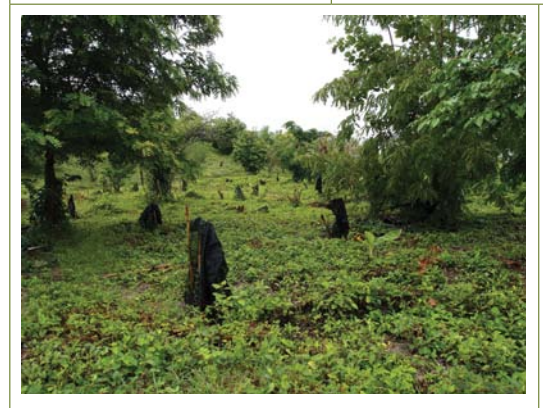
An EETS plantation site established in 2019 at an abandoned lignite mine in Mae Mot, Lampang Province, Thailand.