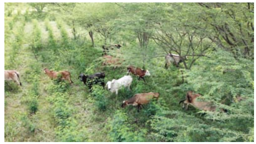
The silvopastoral system as practised on a farm in Cascajal, Piojó, Atlántico.