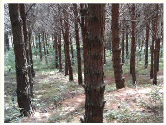
Dense Pinus patula plantation in southern Ecuador.