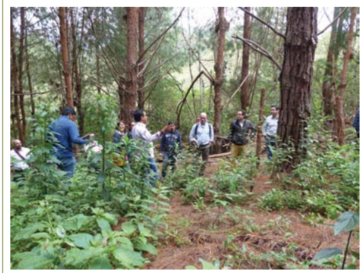
Regeneration after thinning in a pine plantation.