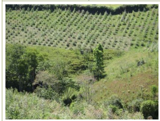
An area of newly planted Eucalyptus seedlings and demarcated restoration area on the Valmor Catafesta property, 2007.