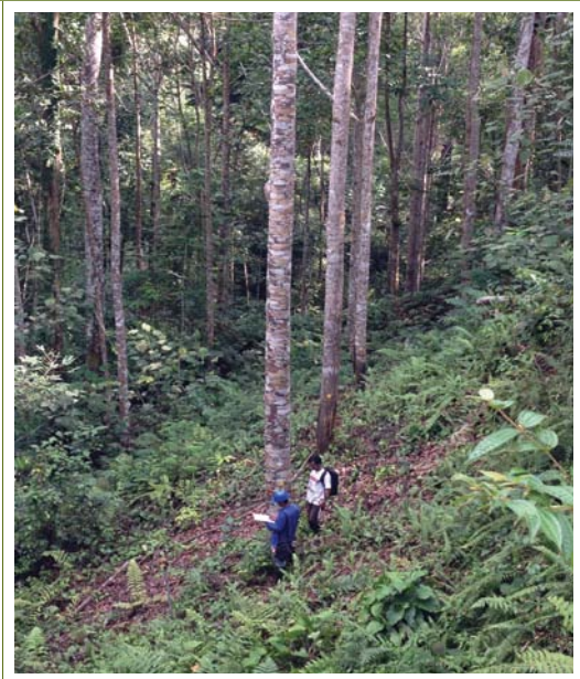
A 16-year-old plantation in a TPTI/SILIN area of the Sari Bumi Kusuma concession.