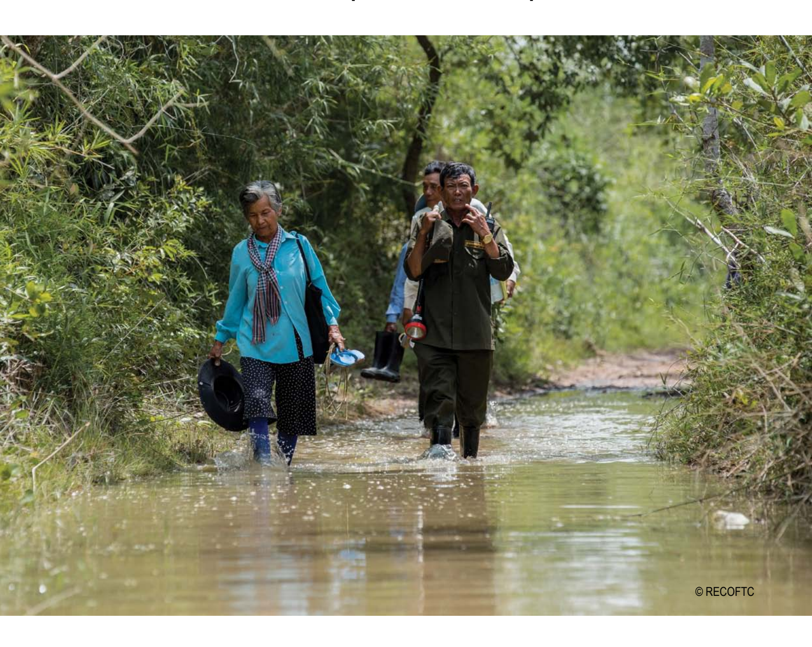
Part II: Case studies in tropical forest landscape restoration