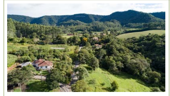
The Alto Vale do Itajaí region.