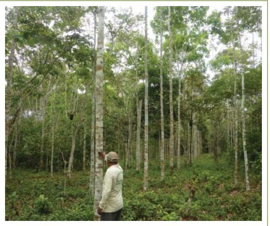
A ten-year-old Dipteryx ferrera plantation.