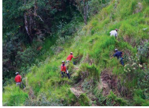
Restoring pastures in watersheds—clearing grass from around recently planted trees.