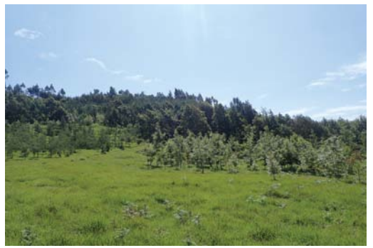
A reforested site with several tree species (e.g. Cypress , Grevillea and Eucalyptus ) using a performance-based incentive approach.