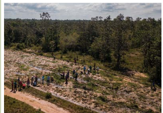
Members of the Prey Kbal Bey community forest restore their forest resources.